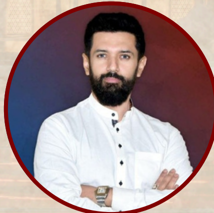
SHRI CHIRAG PASWAN

HON'BLE MINISTER FOOD PROCESSING INDUSTRIES GOVERNMENT OF INDIA