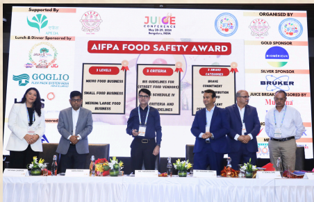
Announcement of Food Safety Awards during International Juice Conference

To promote widespread awareness and adoption of food safety practices, various initiatives have been undertaken by the Ministry of Food Processing Industries, the All India Food Processors' Association (AIFPA), and other stakeholders across the food supply chain in India. These efforts aim to elevate food safety and quality standards within the food processing sector, encompassing street vendors and eateries as well.