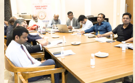
Meeting with Jury members of Food Safety Awards 2024